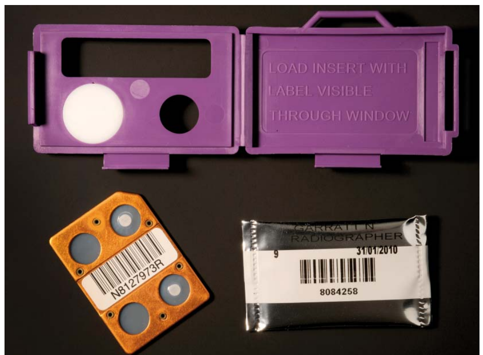
Components of the TLD

TLDs operate by storing the energy they receive from ionising radiation until they are heated – in this case to about 250°C – when the energy is released in the form